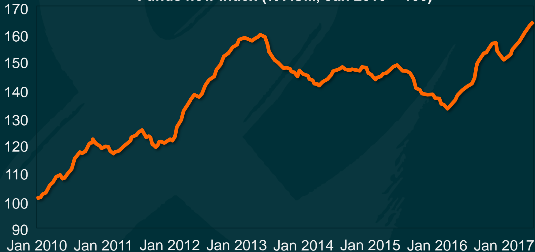
Funds flow index (% AUM, Jan 2010 = 100)