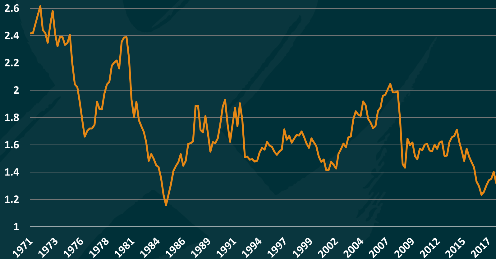
USD x GBP